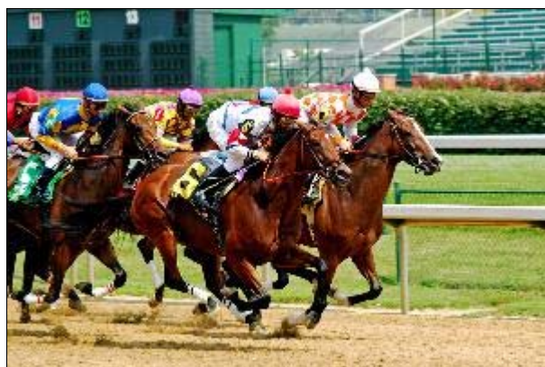
Horse racing at Leopardstown racecourse